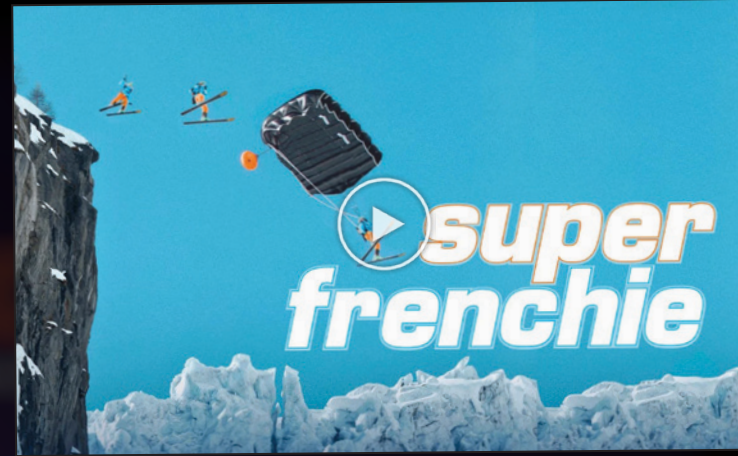
SUPER FRENCHIE DOCUMENTARY TRAILER