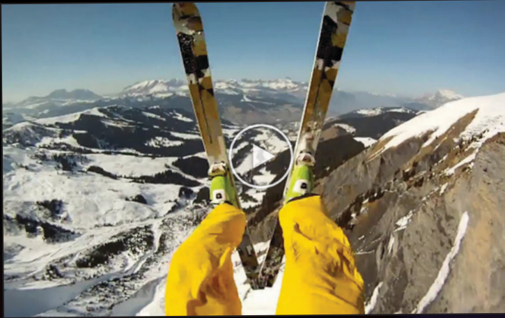
AVALANCH CLIFF JUMP